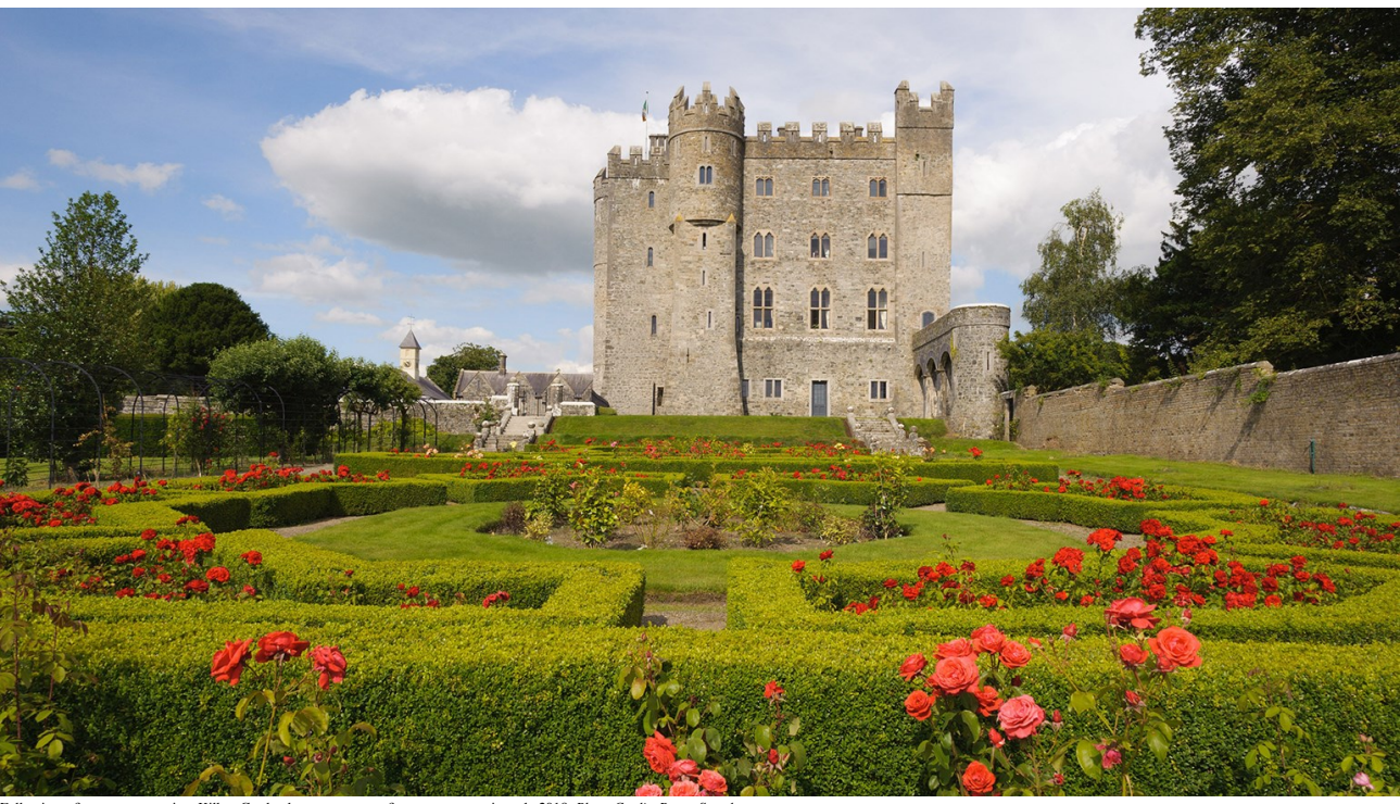
Following a five-year renovation, Kilkea Castle plans to open as a five-star property in early 2018.

Kilkea Castle, located in County Kildare about an hour from Dublin, is poised to open in two phases after a five-year, $35 million renovation. The property, which dates to 1180, will be available for whole property buyouts beginning in November and as a five-star hotel and resort in the first quarter of 2018